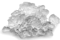
MF 47 Superflake ice Residual water content 15%